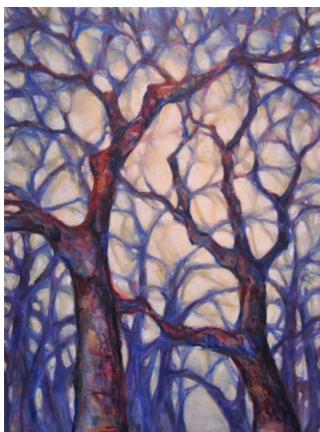
Work by Nancy O'Dell-Keim

a series of expressive, abstracted landscapes. A majority of the works focus on tree imagery conveying moods through