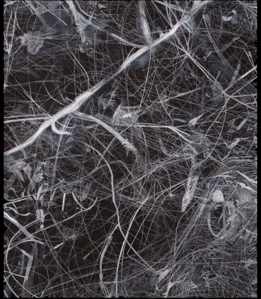
Forrest Dance 60"x 80"

Opening Reception October 11, 2012 5-8 pm