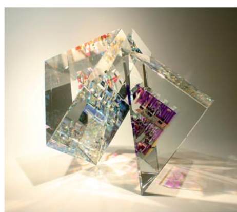
Work by Toland Peter Sand creates edifices and what could be mundane items, such as a bowl or ladder, out of tiny continued above on next column to the right

Kremer, Sand and Zweifel's sculptures embody items used in daily life. Sand incorporates alphabets and symbols that could be used in language or in complex mathematical equations into even more complex geometric sculptures. Kremer