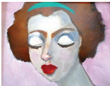
Work by Michele Maffei

Throughout Historic Bluffton, Oct. 13 - 20 -"9th Annual Bluffton Arts & Seafood Festival". The Bluffton Arts & Seafood Festival is back for the ninth year - and still growing. What started as a one-day event in 2005, has quickly become a week of festivities in historic Bluffton showcasing the arts and locally harvested seafood. The traditional opening ceremony, the Blessing of the Fleet and Boat Parade on the May River, will again kick off this week of festivities at 4pm on Sun., Oct. 13, preceded by a Showcase of Local Art, an outdoor art exhibit from 11am – 4pm in the heart of Old Town Bluffton, and finishing the day with the first Oyster Roast of the season at Bluffton Oyster Park. For more details and the full schedule of events call 843/757-2583 or visit (www.blufftonartsandseafoodfestival.com).