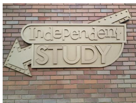
Work by Jim Slagle

This exhibit will represent the interesting and diverse group of artists and will include painting, drawing, photography, graphic design, installation work and sculpture. Though the creative work is varied and stretches across the spectrum of visual art, the exhibit comes together as a whole much like the cohesive department created by the