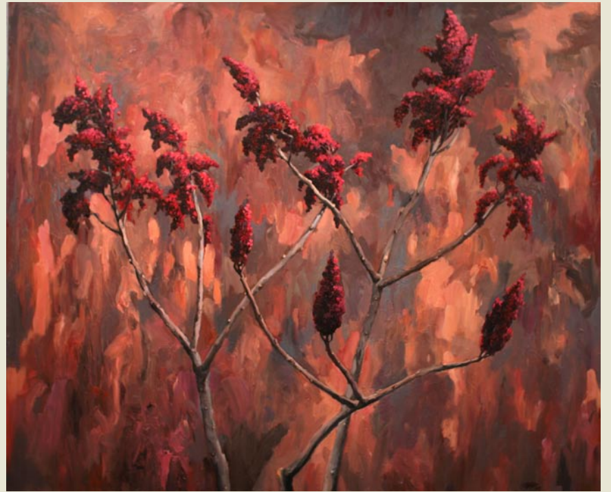
Staghorn Sumac, Winter