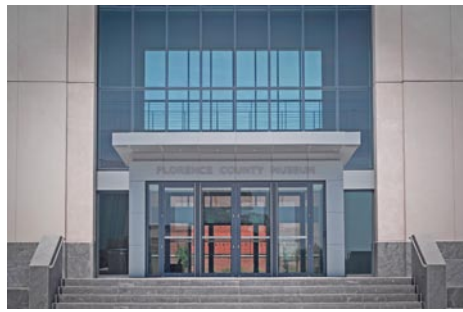
Florence County Museum main entrance

Jon Ellis Meacham is the executive editor and executive vice president at Random House. He is a former editor-in-chief of Newsweek , a contributing editor to Time Magazine , editor-at-large of WNET, and a commentator on politics, history, and religious faith in America. He won the 2009 Pulitzer Prize for Biography for his work American Lion: Andrew Jackson in the White House .