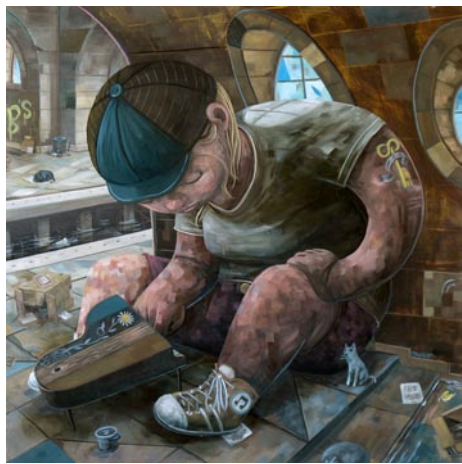
Work by Nathan Durfee

Durfee's painting style is a contemporary update of folk meets pop-surrealism and continually exceeds the expectations of