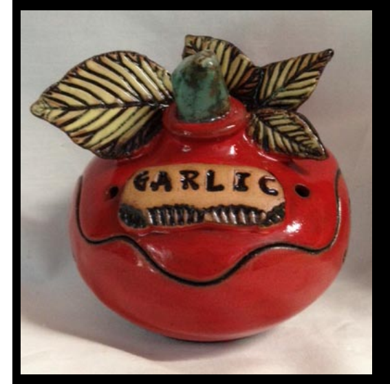
Clay Impressions / Gambino Heath Springs SC

Happy Girl Photography & Boutique Lancaster SC