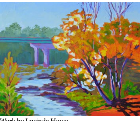
Work by Lucinda Howe

Bold, extravagant color is the first impression of the 30 paintings comprising the exhibition. A blood-red sky glows through green palm fronds. Blue-violet shadows vibrate against vellow patches of sunlit ground. Upon closer inspection, shapes of landscapes and trees appear "Although I hardly consider myself a wild beast," Howe says, "I share a passion for color with Les Fauves, the post-Impressionist artists of the early 20th century whose works emphasized painterly qualities and the use of deep, arbitrary color. I agree with JMW Turner who said, 'Color was not meant to describe, but to arouse and excite.' Painting with a local plein air group takes Howe to places she would not have found on her own and forces her to make a painting of whatever is there. She says trees often appear in her paintings regardless of her original intention. She says, "I may start out to paint a historic house or dilapidated barn and end up with a tree painting. Organic shapes come to the front and architecture becomes background. I'm also attracted to slanted light drawing me in to see what lies beyond an opening in a tree line." On location, Howe paints with oils or fluid acrylics on a small board toned with a warm red to quickly capture light and shapes. She uses pairs of complements for Page 22 - Carolina Arts, October 2016