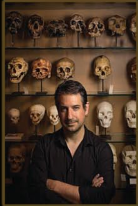
Friday Night Keynote: Noah Scalin, author of "Skull-A-Day"