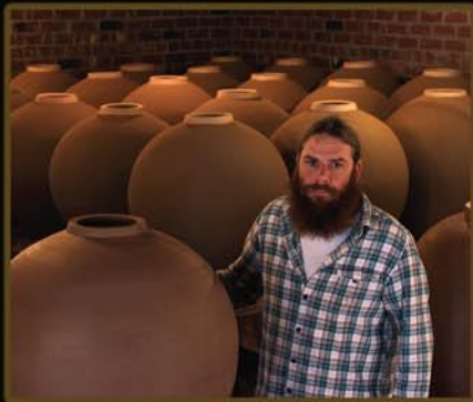
Saturday Night Keynote: Daniel Johnston