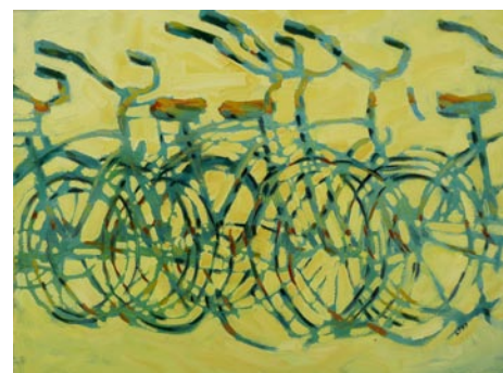
Work by Leslie Pruneau

Painter Leslie Pruneau will be displaying over 25 of her "never before exhibited" paintings and drawings in various styles, sizes and applications. With a fear-