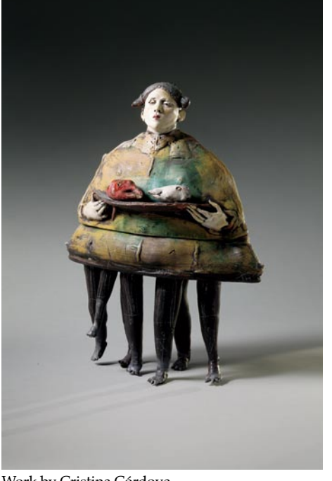
Work by Cristina Córdova

continued above on next column to the right