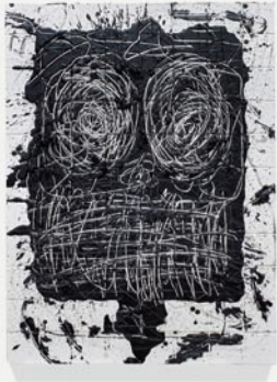
Work by Rashid Johnson

Trackside Studios , 375 Depot Street, River Arts District, Asheville. Ongoing - Featuring works by 20 artists with 14 working studios. Hours: Daily 11am-5pm. Contact: 828/545-2904 or at ( www.tracksidestudios375.com ).