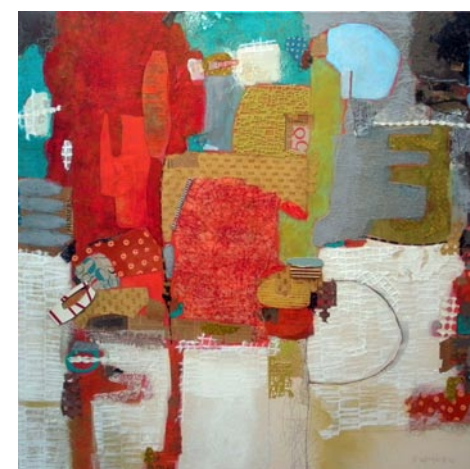
Work by Rod Wimer

Wimer said, "My current abstract collaged works are all about my never ending experimentation with found objects and my love of texture and color in all its forms. These large format canvas collages are constructed of an undergirding of acrylic paint, oil pastel, and graphite. I then continue to build layers with both found and hand-made papers, fibers, and more layers of paint and pastel. I am heavily influenced by the clean