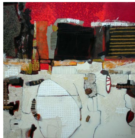
Work by Rod Wimer

City Art Gallery in Columbia, SC, will present the exhibit, New Abstracts , featuring mixed media works by Rod Wimer, on view from Nov. 17 through Dec. 23, 2011. A reception will be held on Nov. 17, from 5 - 9pm in conjunction with Columbia's Vista Lights celebration.