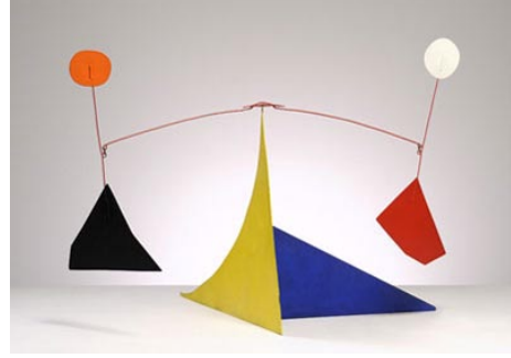
Work by Alexander Calder

Throughout Orange County, Nov. 5 - 13 -"Orange County Artists Guild Open Studio Tour". Over 70 artists participate in this juried event, opening their studios located throughout Orange County, including Chapel Hill, Carrboro, Hillsborough & surrounding areas. Hours: Sat, 10am-5pm, & Sun, noon-5pm. Contact: 919/933-2891 or at (www.orangecountyartistsguild.com).