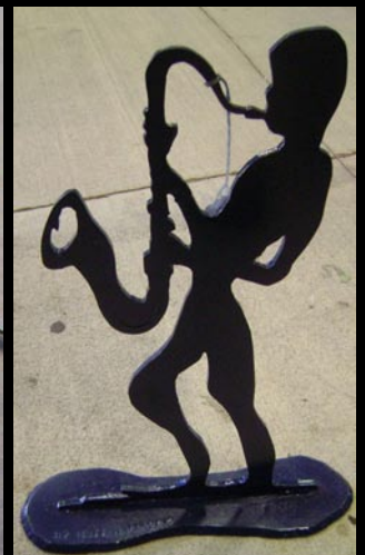
Posted by Avant Garde Center for the Arts