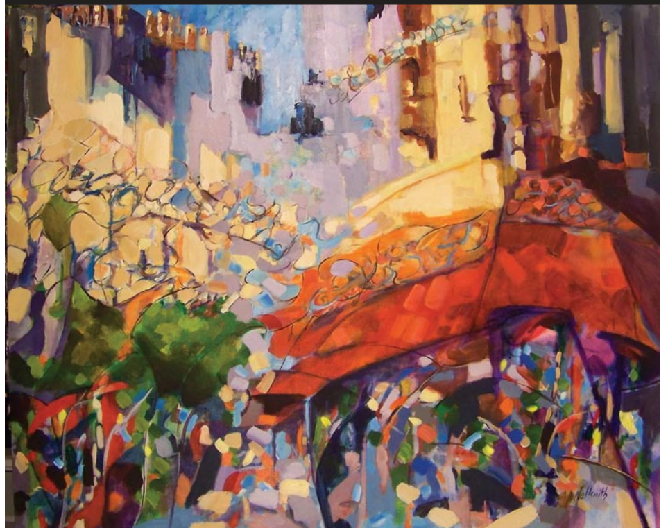
Painting by Bruce Nellsmith

323 Pollock Street • New Bern, NC 28560 Hours: Monday - Friday 10:00 am - 6:00 pm Saturday 10:00 am - 5:00 pm • 252.634.9002 www.fineartatbaxters.com