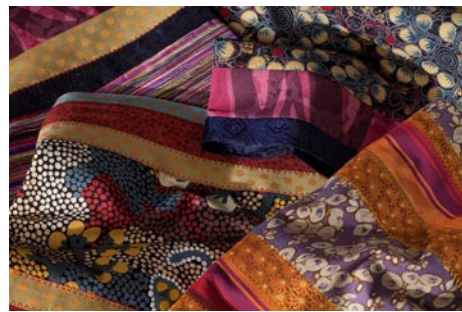
Work by Alice Levinson

Purchases can even be completed over the phone with the gift either picked up at the gallery or shipped.