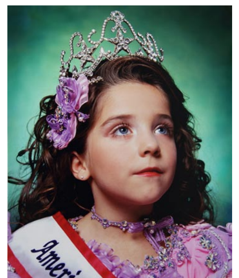
Work by Andres Serrano

SC Institutional Gallery listings, call 864/271-0679 or visit ( www.gvltec.edu/riverworks ).