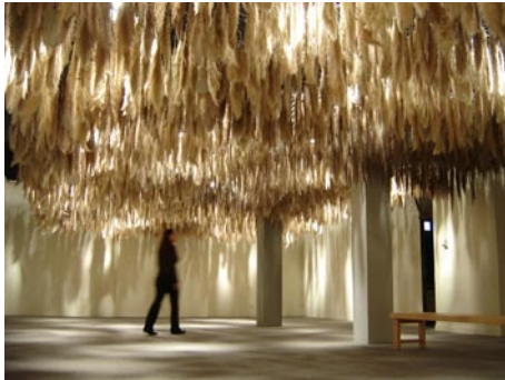
Work by Jarod Charzewski

Retrospective, includes vibrant paintings of French dyes on silk, collages, watercolors on Yupo paper, acrylic on canvas and mixed media. Photographs outlining the artist's process will accompany the exhibit. Viles has exhibited her work throughout the world, including China, Switzerland, Japan, Korea, France, Germany and Belgium. She also had a solo exhibition at HMA in 1995. For further information check our NC Institutional Gallery listings, call the Museum at 828/327-8576 or visit (www.HickoryArt.org).