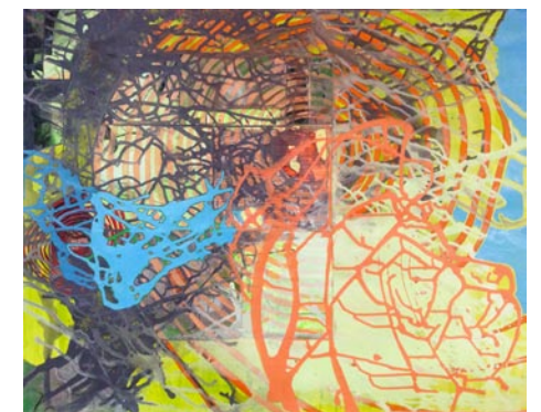
Work by Mary Robinson

Drawing upon our complex and tumultuous relationship with nature, Robinson's artworks invoke both the fluidity of the natural world and the intermittent - and at times dramatic - reconfigurations due to natural disruption and renewal. Often mixing and remixing printmaking matrices along with cutting up and reconstructing prior paintings and drawings, the resulting enigmatic and dream-like images echo the interplay and chaos of elemental forces at work in the world around us.