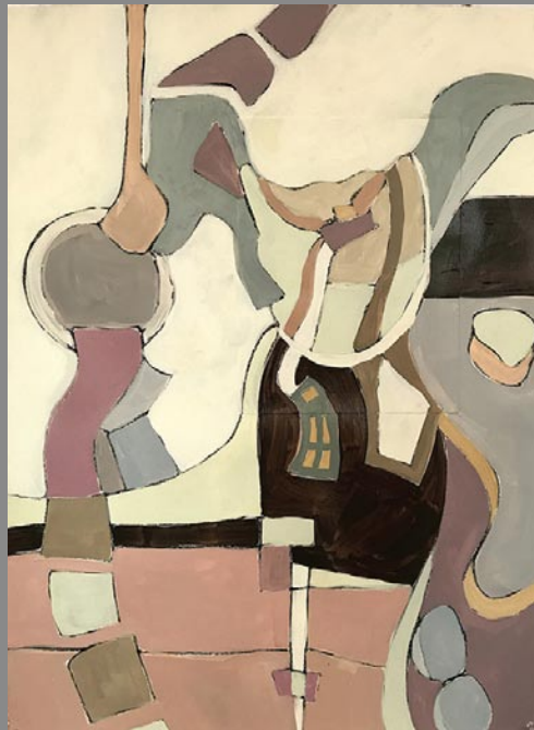
stable as change (50x50)