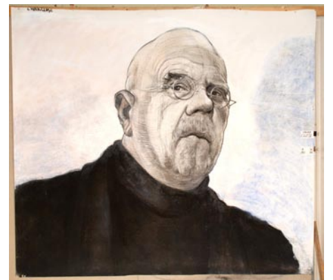
Alphonse van Woerkom (Dutch, b. 1943), “Chuck Close”, 2010, Charcoal, pastel, and white chalk

The Columbia Museum of Art is a charitable nonprofit organization dedi-