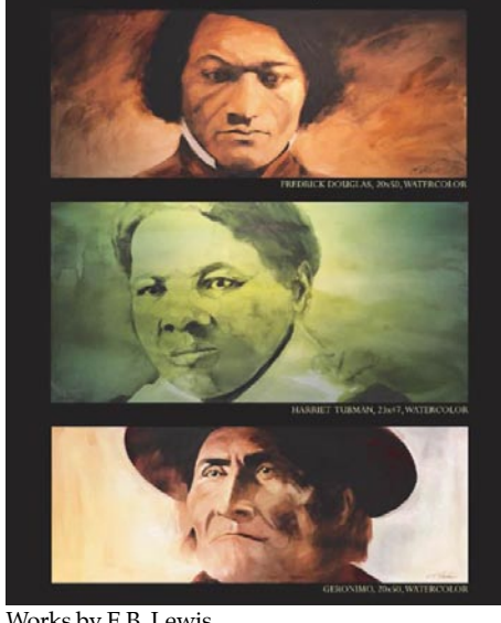
Works by E.B. Lewis

The watercolor paintings from this series were scanned and printed in large scale to hang from the ceiling of the museum, and were even digitally animated into a movie documenting the many escapes through the Niagara area. The Wells Gallery is pleased and honored to bring you the original watercolors made available for sale exclusively through our gallery.