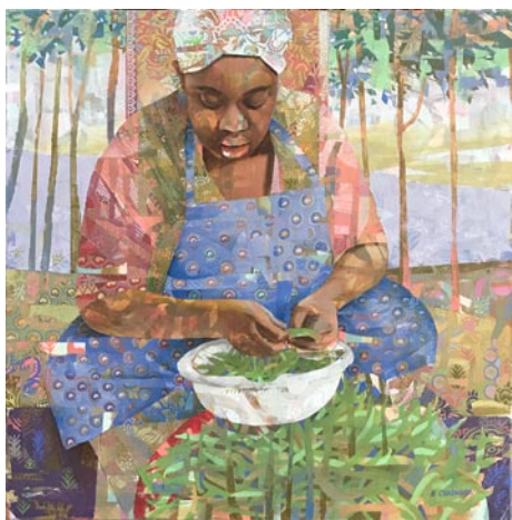
Work by Kevin Chadwick

"My work seems to be ever-evolving, but I am still drawn to and fascinated by strong African American figures. Where my recent works have taken me, is as the role of a storyteller. Whether a lone figure in my patterned background or a family scene, I now try to include a bit of history or a touch of