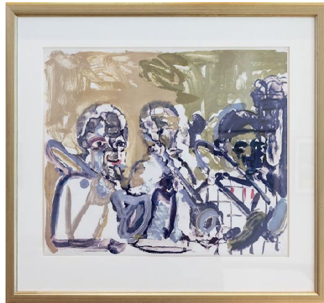
Work by Romare Bearden