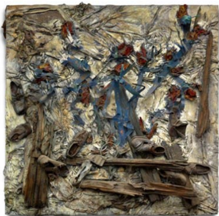
Work by Thornton Dial