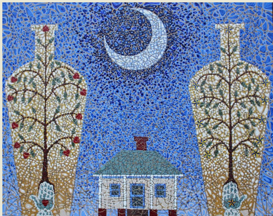
Double Remedy, 2014