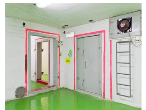
Work by Adam Reynolds

Having met at the Flash Powder Photography residency in 2015, these four contemporary artists reconsider traditional themes and approaches to photography. The bodies of work in the exhibition represent the genres of still life, portraiture, documentary and street photography, all thoughtfully explored and reimagined. Re-vision was previously featured in an exhibition titled Fresh + Flash + Pho-