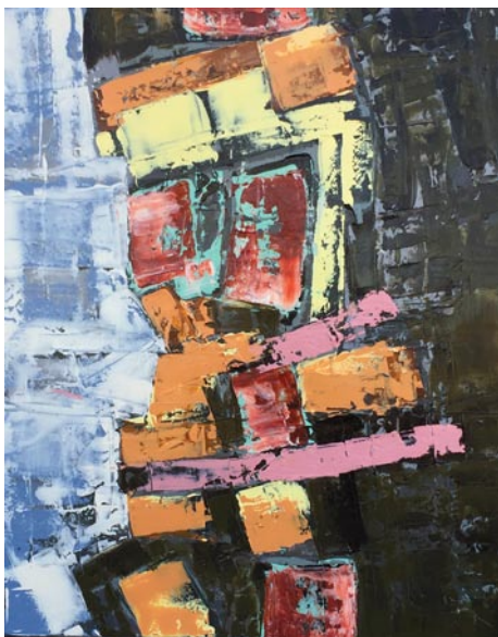
Work by Ben Knight

For further information check our NC Institutional Gallery listings, call 828/859-2828 or visit ( www.upstairsartspace.org ).