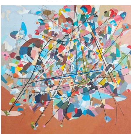
Work by James Williams

Columbia Museum of Art, Main & Hampton Streets, Columbia. Lipscomb Family Galleries, Through Feb. 19 - "CUT!: Costume and the Cinema". This exciting exhibition includes 43 period costumes from 26 films, depicting five centuries of history, drama, and comedy. An experience like no other awaits visitors as they discover the glamour and artistry of cinematic couture, delight in sumptuous fabrics and unparalleled embroidery, and bask in the allure of famous film stars.