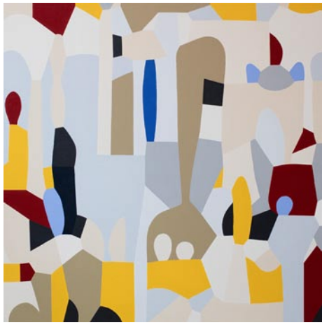
Work by Leonor DeMori

"Label Me Latina/o" also publishes creative literary pieces whose authors self-define as Latina or Latino regardless of thematic content. Interviews of Latino or Latina authors will also be considered. "Label Me Latina/o" is indexed by the MLA International Bibliography, is listed