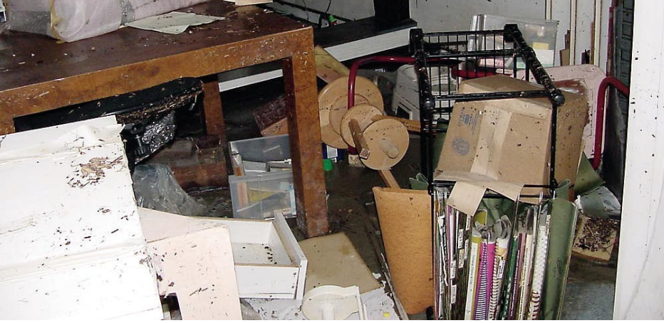
Artist\ Diane\ Falkenhagen's\ Texas\ studio\ -- \ destroyed\ by\ flooding\ during\ Hurricane\ Ike,\ 2008

What would you do if you lost your work, your tools, your images, and a lot more to a flood? Metalsmith Diane Falkenhagen knows what five feet of contaminated saltwater can do to a jewelry studio. CERF+ can help you learn how to protect your career from crossing that fine line.