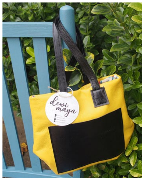
Work by Dewi Maya

West Main Artists Co-op is a non-profit arts gallery located on West Main Street in Spartanburg. It has about 50 members