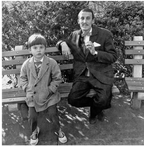
Diane Arbus, "Man and a Boy on a Bench in Central Park, NYC", 1962, gelatin silver print, 20 x 16 in. Weatherspoon Art Museum. Museum purchase by exchange, 2012.