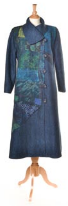
"Fit & Flare Coat" by Liz Spear & Karen Swing

Our policy at Carolina Arts is to present a press release about an exhibit only once and then go on, but many major exhibits are on view for months. This is our effort to remind you of some of them.