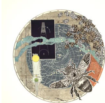
"Orpheus", by Adrian Rhodes, part of an installation works at SECCA

drawn from the museum's collection explore familial relationships, be they between mother and child or self-identified families, and less fixed, but equally important ties - to lovers, friends, and even objects. For further information call the Museum at 336/334-5770 or visit ( http://weatherspoon.uncg.edu/ ).