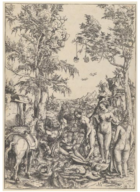
"The Judgment of Paris", 1508, By Lucas Cranach the Elder (ca. 1472-1553); Woodcut

The Gibbes Museum of Art in Charleston, SC, is presenting Charleston Collects: Devotion and Fantasy, Witchcraft and the World's End , featuring works from a private Charleston collection of Northern Renaissance Art, on view in Galleries Two and Three, through June 27, 2021. This selection of paintings and prints from a major, private, Charleston collection of Northern Renaissance art introduces a world of intensely, and sometimes disturbingly, vivid imagery that speaks to uncertainties of the period and remains relevant today. This exhibition is a selection of art curated by