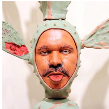
Salvador Jiménez-Flores, "The Resistance Of The Hybrid Cacti" (Detail), 2017.

The Folk Art Center in Asheville, NC, is presenting Inspiration , featuring collaborative works by members of the Southern Highland Craft Guild, on view on the second floor, Main Gallery, through Jan. 17, 2021. The exhibition features 22 collaborative objects by 43 makers of the Southern Highland Craft Guild who specialize in different media. All products are available for purchase, online and in the gallery. Shop online with the link ( https://www.southernhighlandguild.org/product-category/exhibits/main/ ). For further information call the Center at 828/298-7928 or visit ( www.southernhighlandguild.org ).