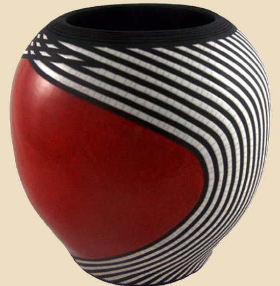
Raku by Charles Chrisco

10283 Beach Drive SW • Calabash, NC 28467