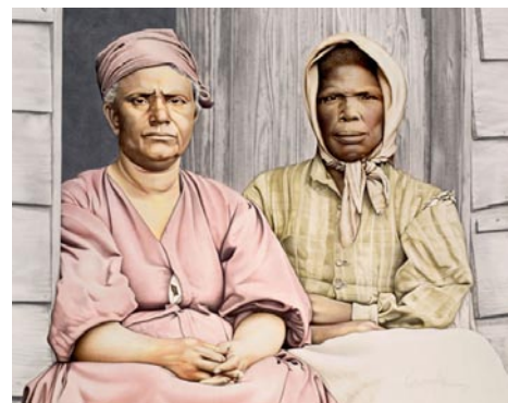
Work by Colin Quashie

The Sumter County Gallery of Art is proud to present an important body of mixed media work by Colin Quashie. The works presented in The Plantation (Plan-ta-shun) explore the possibilities offered by seamlessly blending popular cultural imagery, media based communication and satire to investigate serious cultural, social, and political ideas and issues with sometimes raucous, scathing and tongue-in-cheek humor. Quashie addresses cultural issues using sarcasm intended to spark popular debate and discussion among his audience while challenging status-quo social and cultural assumptions. His works also often play upon various popular stereotypes and ridiculous irrational cultural assumptions in order to trigger an awareness of our personal limitations in understanding each other's daily life experiences.