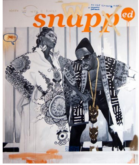
Work by Fahamu Pecou

a stand-in to represent black masculinity and both the realities and fantasies projected from and onto black male bodies. I seek to challenge the expectations around black men and, to a larger extent, society in general. Adopting the traits typically associated with black men in hip hop, I appropriate their more popular associations and distort or exaggerate them by placing them within a fine art context. The end result is a parody on our obsession with celebrity, our exploitation of black masculinity and the divide that racial ignorance and stereotypes perpetuate. These ideas are expressed in paintings, videos and live performances. Each medium allows me to articulate various nuances around my themes and further distort the assumptions we tend to make about one another.'