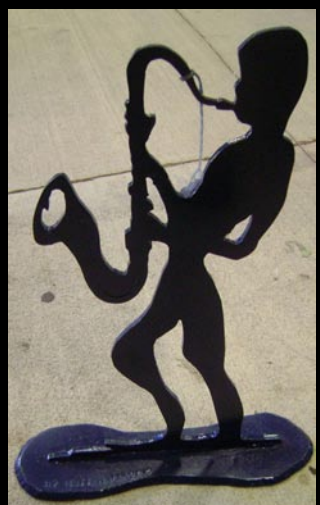
er Iron I