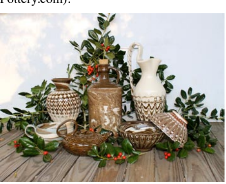
Works from Eck McCanless Pottery

Lufkin Pottery's Snowman Party invites visitors to create their own snowman. Snowman forms and features, including hats, scarves and various glaze colors will be available. The finished snowmen will be ready to pick up after Dec. 22, in time for Christmas. The shop is located at 7437 US Highway 220 South, Asheboro, NC. For more information, visit (www.Lufkin-Pottery.com).