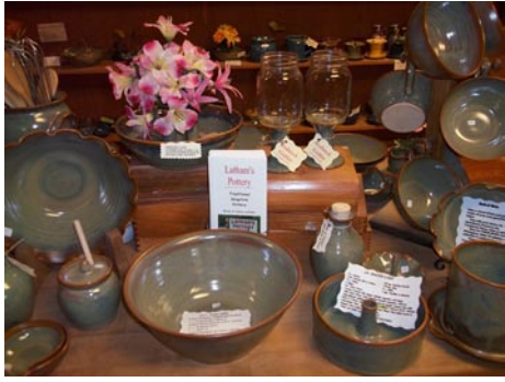
Works from Lathan's Pottery

Jugtown Pottery's kiln opening will begin with the Jugtown Museum opening at 7am. The event will feature collaborations, animals in clay, crafts and jewelry. For more information about the Jugtown and O'Quinn holiday events, visit (www. PottervOfBusbeeRoad.com). Jugtown is located at 330 Jugtown Road and O'Quinn Pottery is located at 4456 Busbee Road. The Museum of NC Traditional Pottery will have a list of shops participating in their Christmas Open House. The mu seum is located at 127 East Main Street in Seagrove. For more information, call 336/873-7887.