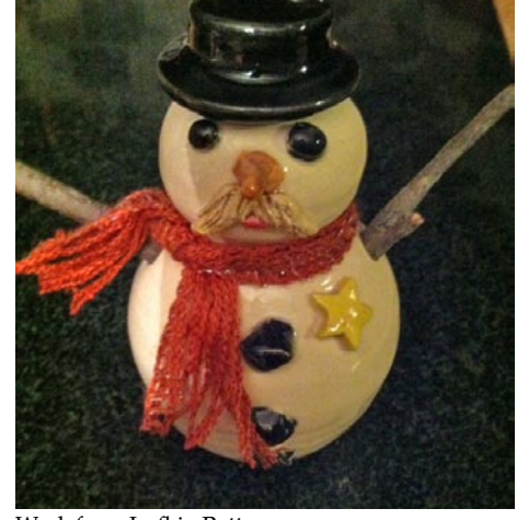
Work from Lufkin Pottery

holidays for the Latham's Pottery Holiday Open House. Door prizes will be given away and Bruce Latham will demonstrate from 1 to 5pm on Dec. 13. The shop is located at 7297 US Highway 220 South, Asheboro, NC. For more information, call 336/873-7303.