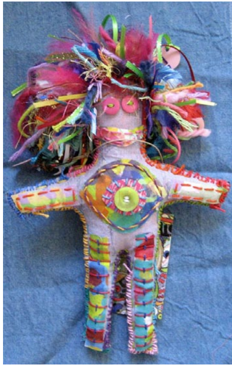
A single Who Doo Doll