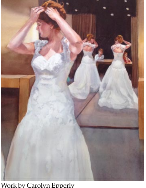
Work by Carolyn Epperly (<u>www.marymartinart.com</u>).

For further information check our SC Commercial Gallery listings, call the gallery at 843/723-0303 or visit