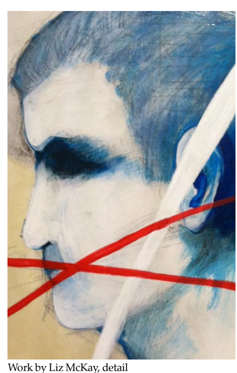
704/240-9060 or visit (www.ncgallery27.

For further information check our NC Commercial Listings, call the gallery at