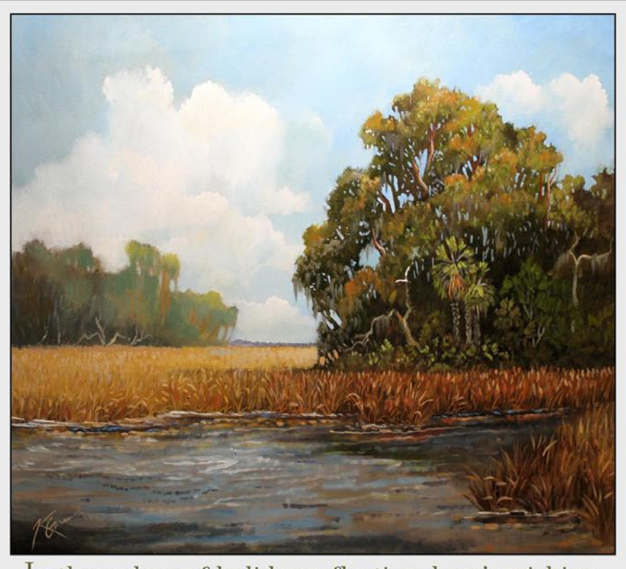
In these days of holiday reflection, here's wishing you a time of peace, joy, and love. Merry Christmas and a Happy New Year!