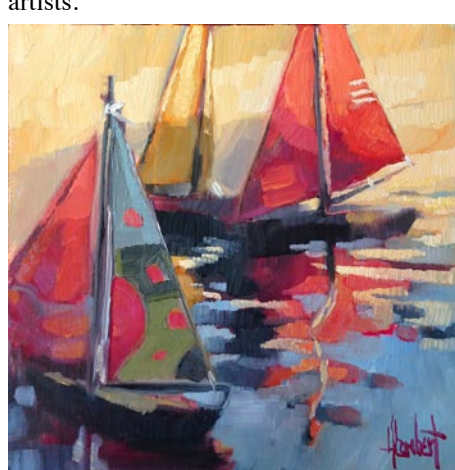
Work by Hilarie Lambert

The Light of Paris and the Low Country will feature the artists' glimpses and observations of the vast cultural and natural landscapes of home and abroad. The locales of Paris and the Low Country provide ample subject matter for these artists.