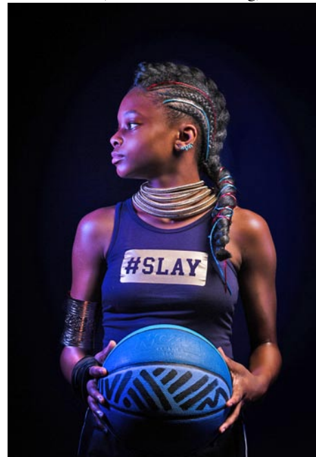
Work by CreativeSoul Photography

nerable and contemplative. Others are bold and daring, their postures barely contained within the panel's parameters." For further information call the Council at 919/560-2787 or visit ( www.durhamarts.org ).