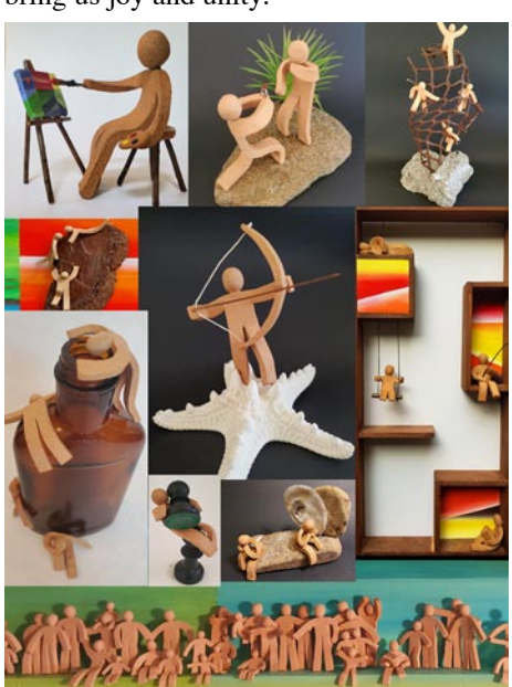
Works by Pascale Sexton Bilgis

Simple Pleasures is all about finding joy in everyday activities, like sitting under a tree with friends, a walk along the riverbank, or even a stroll through the park. Using bright colors, vivid imagery, and intricate quilting to create texture, the artist reminds us that life is too short to forget about the simple things in life that bring us joy and unity.