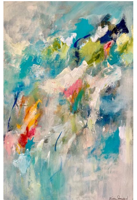
Work by Vickie Jourdan

In early 2022, the group returns to the Coastal Discovery Museum for their biennial exhibition, entitled Interpretations . By focusing on how art's formal elements can inform abstraction, they each allow line, color, form, texture, shape, and value