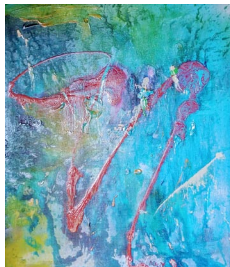
Work by Missy Gentile

Visitors to the exhibit can expect to see bright colors, bold strokes and geometric patterns. Simple forms and textures produce a dramatic effect.