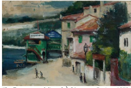
"Le Restaurant Mistral À L'estaque", circa 1870, by Paul Cézanne (French, 1839-1906), Gouache, watercolor and pencil on paper, 9 1/8 by 14 inches. Loan courtesy of a private collector, Private Collection

"The first group exhibition was in Paris in 1874 and included work by Monet, Auguste Renoir, Edgar Degas and Paul Cézanne. The work shown was greeted