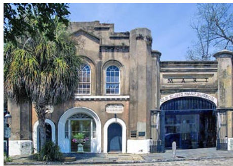
Old Slave Mart Museum

Purchase price for tickets is $35 for adults and $10 for children (ages 12 and under). Tickets can be purchased in advance via Charleston's Museum Mile website through Dec. 31, 2021, at ( https://www.charlestonmuseummile.org/ticket-packages/ ) making these passes a great holiday gift. During the month of January tickets can only be purchased in person at the Kiawah Island, Mount Pleasant, North Charleston, or Downtown Visitor Centers. Explore and enjoy all that Charleston has to offer with Museum Mile Month and