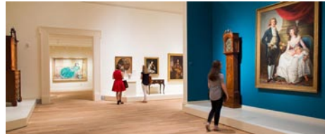
Inside the Gibbes Museum of Arts

During the month of January, 2022, Charleston, SC's distinguished cultural sites will once again come together for Museum Mile Month. Those who purchase a Museum Mile Month pass will be able to enjoy access to thirteen participating sites. Passholders can spend an entire month learning about the city's rich history and culture while visiting sites in the order that best fits their schedule.