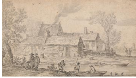
Jan van Goyen, Dutch, 1596-1656, "Figures, Boats, and Cottages on the Banks of an Estuary," 1626, black chalk and gray wash on paper, 5 7/8 x 10 7/16 in. (15 x 26.5 cm). Ackland Art Museum, University of North Carolina at Chapel Hill. The Peck Collection, 2017.1.40.

This Focus on the Peck Collection installation presents the work of three artists who were instrumental in promoting this new landscape style. Two drawings from the Peck Collection by Jan van Goyen and Pieter de Molijn are shown together with a painting by Salomon van Ruysdael. Each river scene shares common elements, such as a low horizon line, trees that punctuate