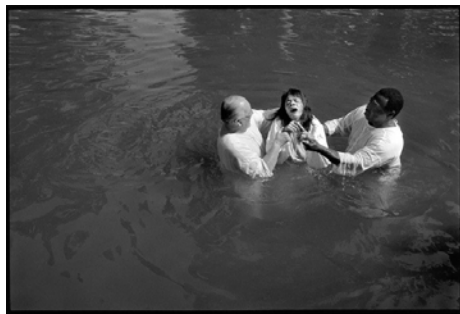
Ralph Burns, "Baptism # 1, Jordan River, Israel," 1996, gelatin silver print; © 2022 Ralph Burns, Courtesy of the artist.

an outstanding permanent collection of more than 5,000 objects spanning antiquity to the present day. On the occasion of the expansion, the Museum has acquired more than 100 new works of art. Representing commissions, gifts, and purchases, the new works encompass important and diverse examples of historic and contemporary art from around the world, and will be installed in the Museum's new building and the surrounding landscape. Highlights include a gift of 28 sculptures by Auguste Rodin, and work by such internationally acclaimed artists as Roxy Paine, Ursula von Rydingsvard, El Anatsui, Jaume Plensa, Jackie Ferrara, Ellsworth Kelly, and David Park, among others.