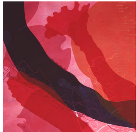
Work by April Flanders

The web of life under the surface of aquatic ecosystems is exceedingly complex and devastatingly beautiful. In a place where species interactions begin at a microscopic level, small changes have huge impacts and huge changes wreak havoc. Remove a key predator, and prey takes over; add another predator, and the first one declines. With the rise of globalization, human mediated transfer mechanisms give rise to invasive species, overwhelming the delicate balance of aquatic ecosystems. These unintended ecological interventions cause Trophic Cascades , revealing nature's fragility.