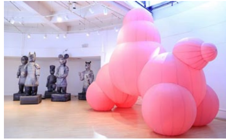
(Left), Lizabeth Rossof, "5 XI'AN AMERICAN WARRIORS", 2019, nylon fabric, dimensions vary. (Right), Sharon Engelstein, "Seeker", 2012, nylon fabric, forced air, 14 x 9.4 x 18.6 feet.

defy consumerism, along with the methods and myths it perpetuates about womanhood and femininity. The exhibition consists of 12 life-sized, freestanding sculptures made from everyday feminine materials arranged in a maze-like exhibition space. The layout of the exhibition creates alcoves, enabling individual observation and interaction with each sculpture. For further information call the Center at 864/735-3948 or visit ( www.artcentergreenville.org ).